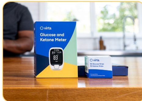
Glucose and ketone meter