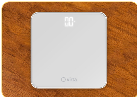
Digital weight scale